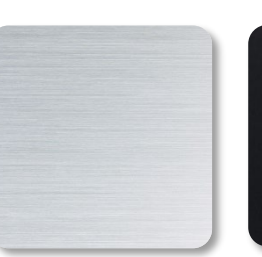
Clear Matte Brushed